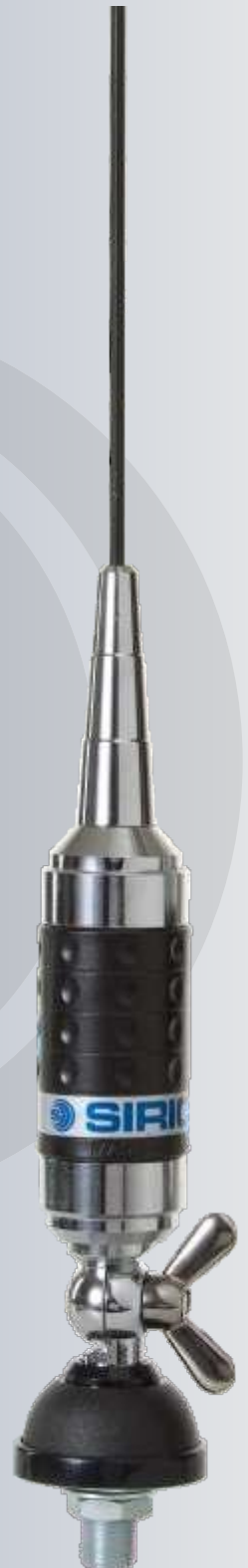
SUPER CARBONIUM 27