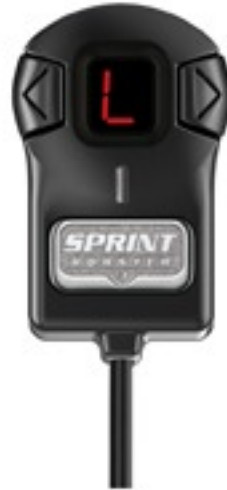
PEDAL LOCK MODE